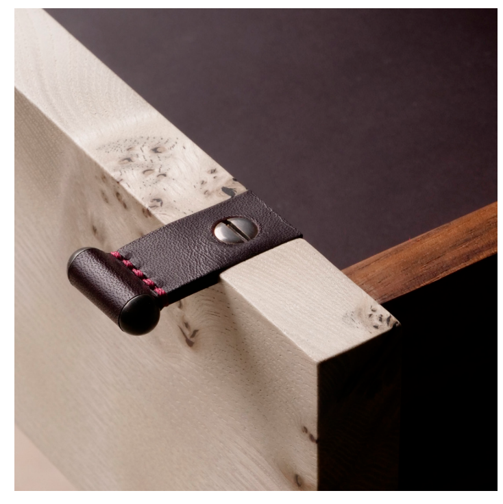
Mora Chest of Draws, Long