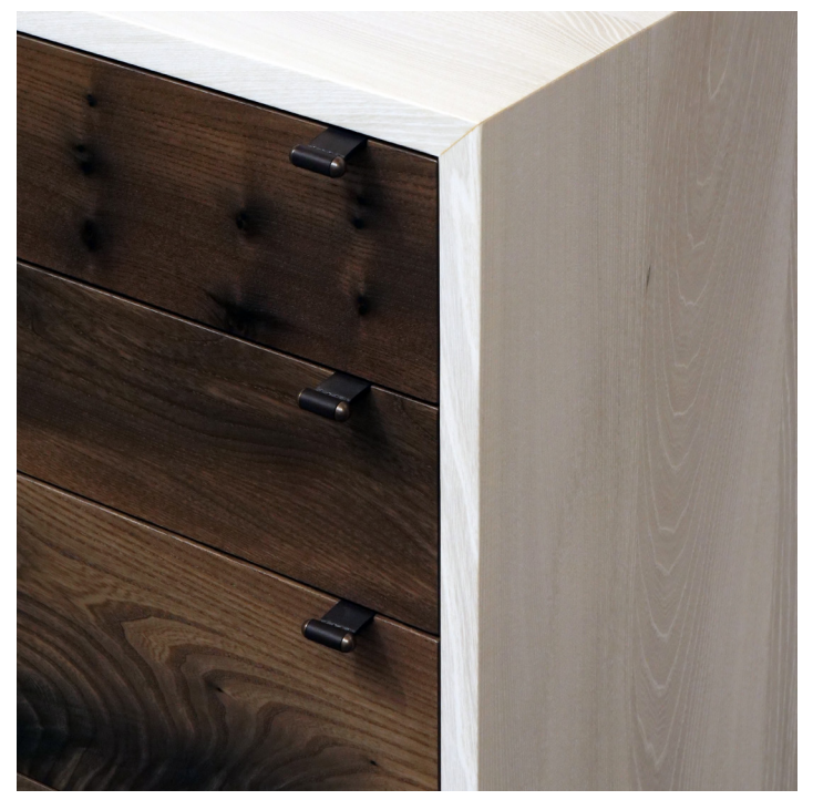
Mora, Chest of Draws